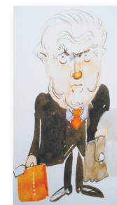
Greene

The writer's answer came: 'I am my books'. Graham Greene wanted to be judged by what he wrote, and he carried shyness and self-effacement to the point of resisting appearances on film and at literary events whenever possible. But a festival in his name was nevertheless established, and has thrived: it is now in its nineteenth year. People from all over the world will again descend on Berkhamsted to celebrate his life and works – many of them seasoned Greene Festivalgoers, some first-time visitors. All are welcome, and all assured of a varied and interesting programme. There will be discussion and debate, but friendliness and laughter, too. I hope you will come along.